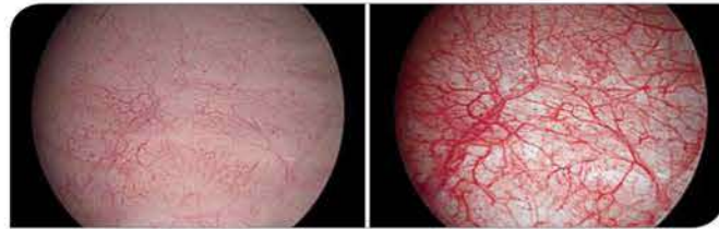
Selective Color Enhancement (SCE)